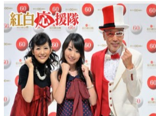
(New Year song contest on TV)