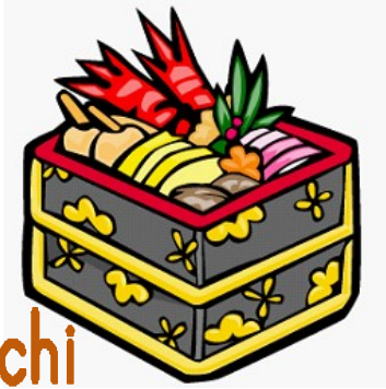
Osechi (New Year holiday food)