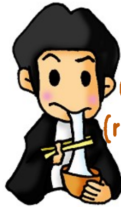
Omochi (rice cake)