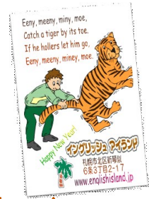
New Year's postcard