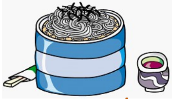
soba (buckwheat noodles)