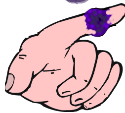
a jammed finger